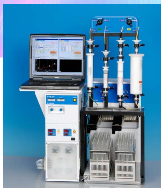
W-Prep 2XY B Type Dual Channel, 0-80ml/min Easy & Tight Column Connection