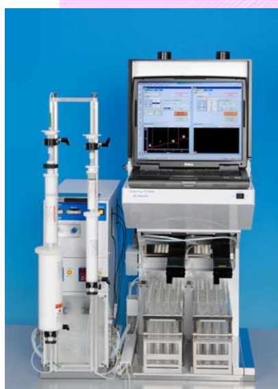
W-Prep 2XY A Type Dual Channel, 0-80ml/min More Compact, Modular & Space Saving