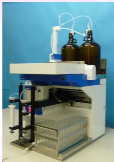
“New” AI-580 Single Channel, 0-80ml/min Easy Access to Solvent Bottles